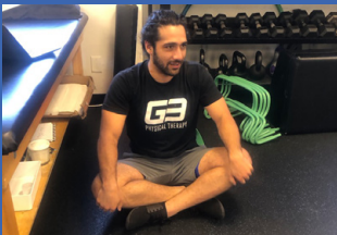
Starting position on the floor or sit in chair.

But not everyone can jump into these movement patterns. Please consult your physical therapist on how you can slowly progress. You may start by sitting in a chair or even in a standing position. The idea is that the more variety of movements, the more opportunities to keep your joints lubricated and your muscles supple.