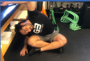
Gently sidebend and hold for 3 seconds. Repeat on other side.