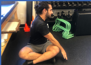
Gently turn and hold for 3 seconds and slowly rotate to opposite side. Repeat 3 times on each side.