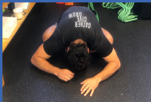
Gently fold over to your comfort level and hold for 3 seconds. Repeat 3 times.